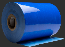
LEVI'S BUILDING COMPONENTS Blue Film