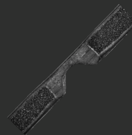
FastVent™ PLUS III