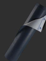
ROLOSHIELD™ PRIME SA